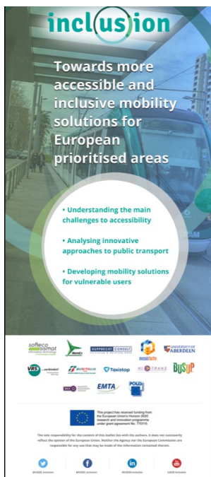
The INCLUSION roll-up

The project has developed a roll-up poster that can be used for promoting the project at events and it forms a coherent identity with other communication elements of INCLUSION. The roll-up highlights the INCLUSION objectives and promotes the website and the social media channels as a source for more information. It also features all project's partners.