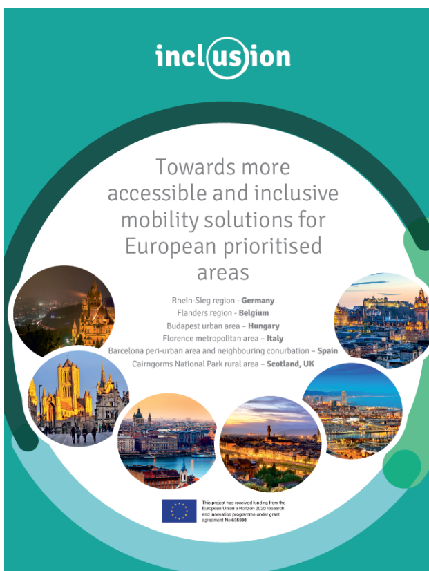
The project's leaflet

The project leaflet introduces INCLUSION to the main target groups and to a wider audience. The leaflet will be printed and an electronic version will be available for download from the website. The leaflet aims to inform a wide audience about the project's objectives and expected results. It will also provide more details about the INCLUSION activities. The leaflet will be used for distribution at the European, national and local levels by all project partners.